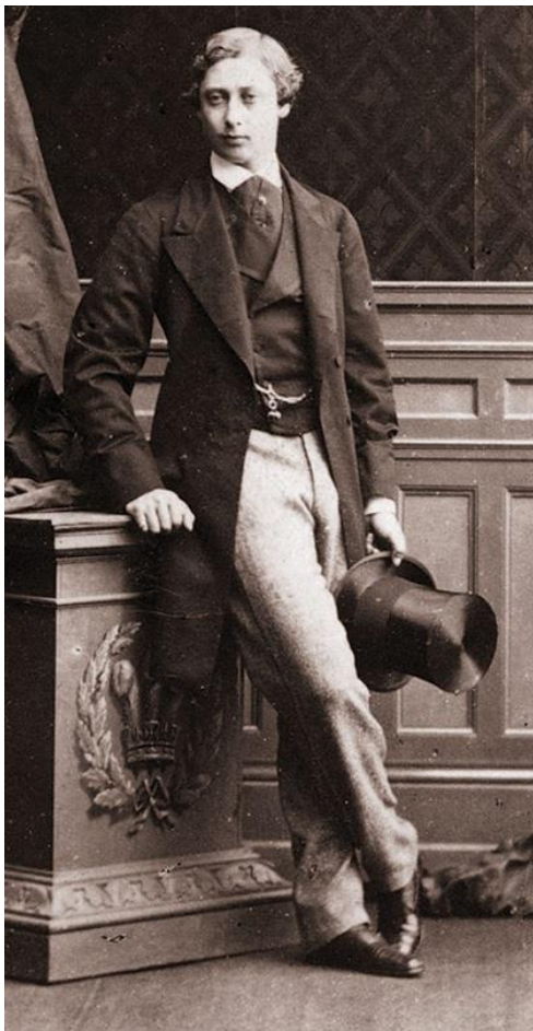
Albert Edward, Prince of Wales (1841-1910)