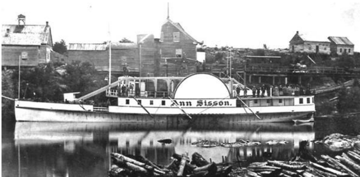
Ottawa River Steamer Ann Sisson

On Monday morning, September 3, 1860, the Prince of Wales was escorted by a party of lumbermen on a thrill ride down the timber slide at Chaudière Falls before boarding the steamboat Ann Sisson at Aylmer and sailing up the Ottawa river. Off Pontiac, on the Quebec shore, the Prince and his suite were transferred to a fleet of canoes and set out across the river. The following account of the, at times chaotic, Royal visit to the United Counties of Lanark & Renfrew was published by the Perth Courier four days later.