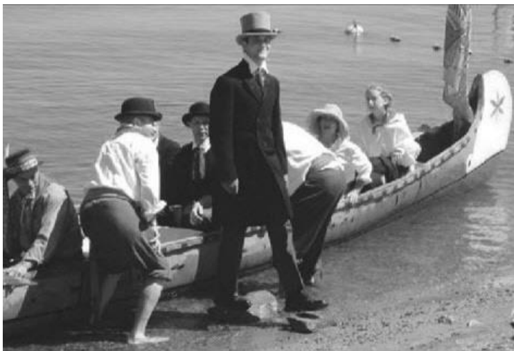
2010 re-enactment of the Prince's landing at Arnprior.

For hours previous to the arrival of the Prince, crowds of people might have been seen making their way to the steamboat landing, where a suitable platform had been erected and carpeted for the reception of the Prince, and a line of low wharfage put up on the lake [river] shore to facilitate the landing from the canoes.