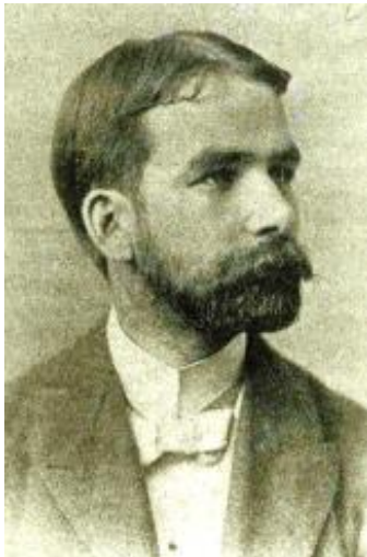
Robert Stanley Weir

Weir was born in Hamilton, Ontario. He worked as a teacher and lawyer before he was appointed a Municipal Court Judge at Montreal and then named to the bench of the Exchequer Court of Canada. He was also a published poet, and his interest in a National Anthem was prompted by the 300 th anniversary of the founding of Quebec City. At first Weir's composition 1 was just one more among the dozens of alternate English lyrics sung to the tune of the 'Chant National', but they soon began to gain popularity across the country.