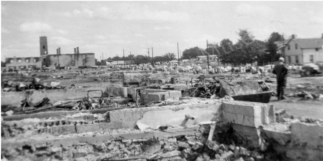
Aftermath of the firestorm, June 1959

The noise was deafening. "All one could hear was the howling wind, exploding furnace oil tanks, and the crash of burning timbers" . 8 When the fire reached Mel Lee's Hardware Store it set off a loud and colorful barrage of exploding paint cans and rifle ammunition. The Ottawa Journal described Lanark that afternoon as "a scene of almost indescribable terror" . The Ottawa Citizen called it a "holocaust" .