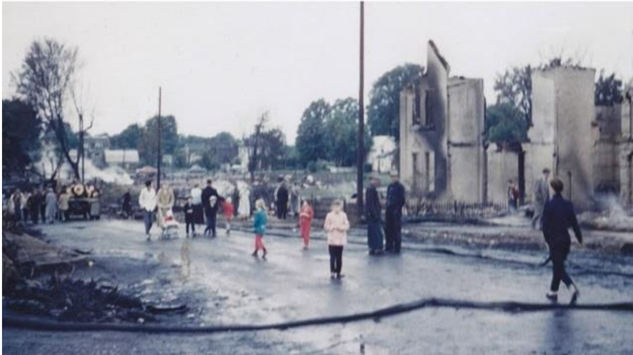
Disaster tourism, June 1859

The fire completely destroyed everything within an area approximately 1,100 feet long and 600 feet wide and caused varying degrees of damage at other scattered locations, some at considerable distances from the center of destruction. In all, 33 houses, apartments, businesses, and public buildings were destroyed. About 100 10 of the village's 950 residents, or 43 out of 280 families, were made homeless. The Dominion Fire Commission's report on Fire Losses in Canada estimated the total property loss at $738,420. Other estimates, inclusive of building contents, store inventory, personal possessions, etc., ranged from $1,000,000 to $2,000,000 (1959 dollars). Remarkably, no lives were lost and only two people required brief hospital treatment; Lanark Fire Chief Del Storie 11 , suffering from exhaustion, and Blanche (Mrs. James) Perry 12 , who collapsed.